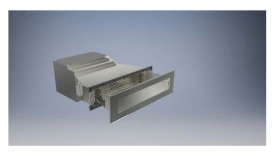
Strainer basket as a part of the skimmer front: B 500 EVO skimmers multiply pool design options.

On account of the large skimmer flap, an extremely high circulation capacity is achieved in the rear part of the surface skimmer by means of a suction port with a 2" female thread . The B 500 EVO is completely made from top quality V4A stainless steel – including the strainer basket.